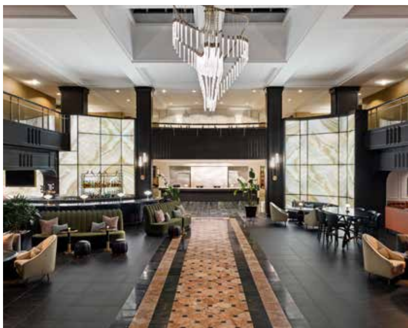
The lobby of the Omni Severin Hotel gives way to a reception desk in front of a mural featuring smoke from a train engine.