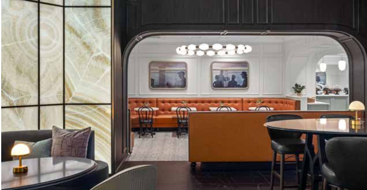
Artwork depicting train travel adorns the 8th Notch Café and Market at the Omni Severin Hotel in Indianapolis.