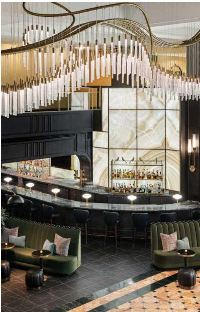
(Right) A view of the Bar Cardinale inside the Omni Severin Hotel in Indianapolis shows the historical inspirations incorporated into the design of the renovation.