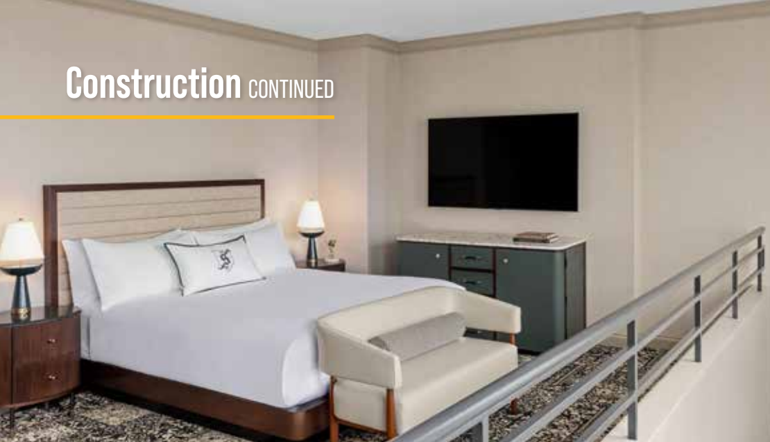
(Above) Some of the unique guestrooms at the Omni Severin Hotel in Indianapolis feature loft construction.