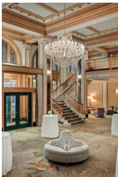
Old and new designs blend to create a unique look to shared spaces at the Omni Severin Hotel in Indianapolis.